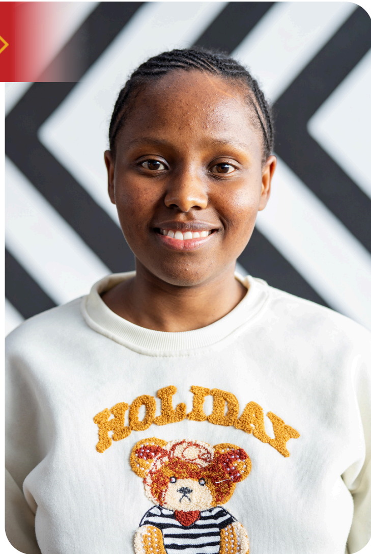
Khethisa High school Lesotho

I am thrilled to have the opportunity to study medicine and deepen my appreciation for social justice. The skills I will acquire at UGHE will enable me to make meaningful contributions to my country and serve people of all backgrounds. I've always aspired to help my country, and to join UGHE will groom me to become a better leader in healthcare. This education will equip me to address health disparities and promote equitable access to medical services, fulfilling my long-held dream of making a positive impact in my community.