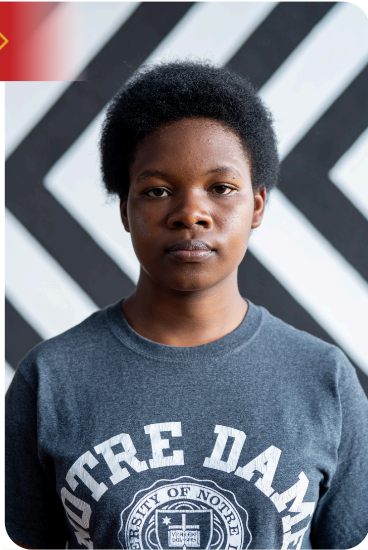
Ecole Secondaire Saint Francois de Shangi Rwanda

Therefore, I am very excited to gain the special global health education in UGHE. I will graduate with enough skills to serve my community with humility and empathy. It is also crucial to meet with very important health professionals with different skills , colleagues including internationals to gain foreign cultures and sharing life skills.