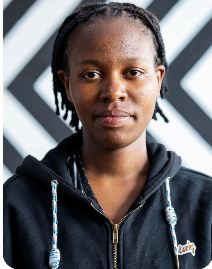
Fawe Girls School Rwanda

I have been dreaming about becoming a medical doctor since I was young. So this is very amazing opportunity, that I have ever got to undertake my studies at UGHE and for this I'm very certain that I'm heading to my dream. I'm very excited about class sessions because I hope that we will be having all the materials needed for even doing practicals and I think that the lessons will be very much interesting for me as a medical student. I'm very excited to meet new people and making new friends as well.