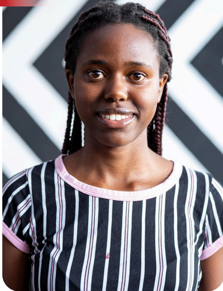
College Saint Andre Rwanda

The most pressing issue in healthcare today that I see is increase in demand for those who need healthcare while the professionals either nurses, doctors, are still limited. The population increases daily but those willing to join the medical careers are not increasing. Healthcare demand overpasses the supply.