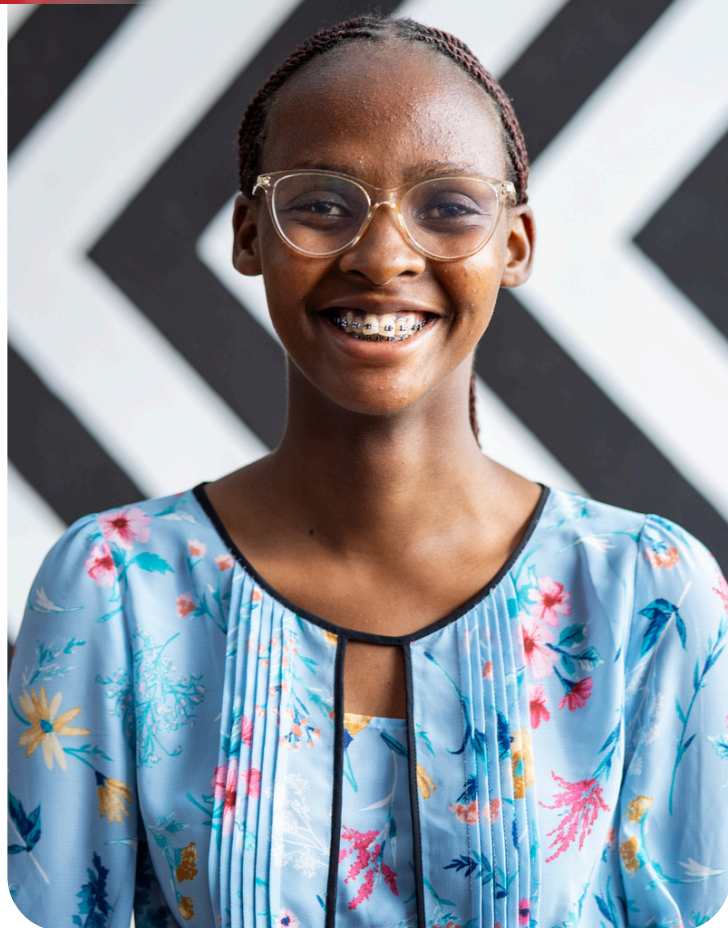
Gashora Girls Academy of Science and Technology Rwanda

I believe that one of the most pressing issues in the healthcare system these days is that quality and advanced healthcare services like radiography among others, are less accessible and costly for many people to afford, especially those in rural areas. This is mainly because such services are mostly provided in a few places where not everyone can easily travel to and the shortage of novel medical technology that can be used to ease booking hospital appointments and online diagnosis.